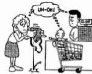
Illustration by Tony Biddle